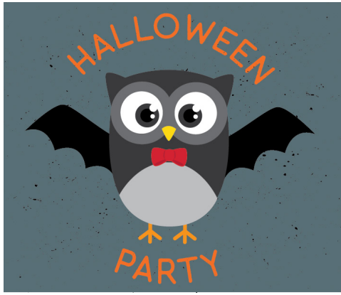
Saturday, October 27 // 9AM HALLOWEEN PARTY

St.Isidore - 7:30 PM // (Free will offering for her community.)