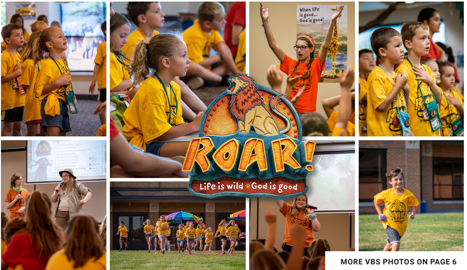
MORE VBS PHOTOS ON PAGE 6

For confidential information or to register call 800-470-2230 OR VISIT OUR WEBSITE: HelpOurMarriage.org