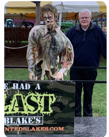
PHOTOS FROM SITE'S OUTING TO BLAKES HAUNTED ORCHARD ON OCTOBER 11