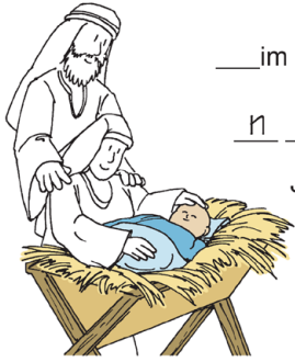
© 2019 CRI • PO Box 9290, Canton, OH 44711 • www.ChildrensBulletins.com

M__ry g__a__v__ birt__ to __s__o__. A__d Jo__p__g__v__e __im t__h__ __n__m__ J__u__.